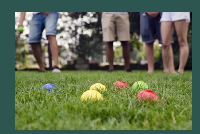
Indulge in outdoor pursuits promising all-day fun. Play bocce. Go bowling. Catch a movie. Take your four-legged friend for a stroll. Spark your creative spirit with music or art studios. Or use sidewalk chalk with your budding artist.